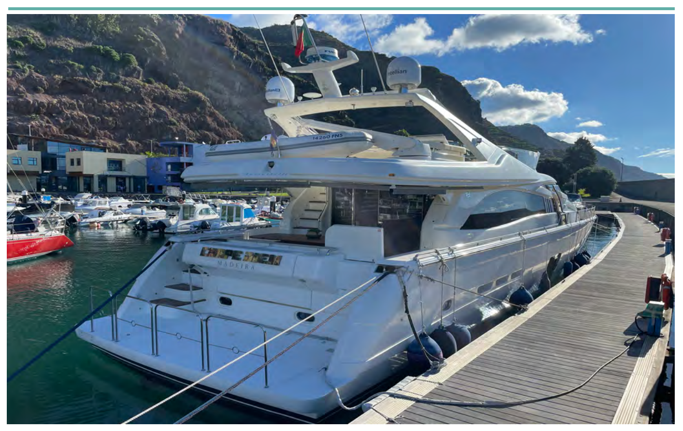
Hull number: 17 - Year of built: 2006 - Year of first registration: 2006 - HIN: IT-FER73117B606